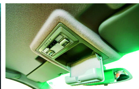
Neatly tucked away in the roof on the front is a cute little flap that conceals your sunglasses when not in use.