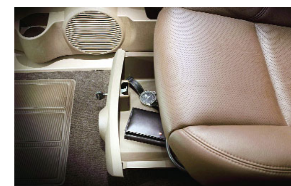
The abundance of storage space is this lockable underseat tray - a neat personified by touch indeed!