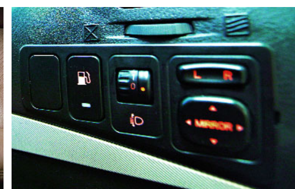
This cluster of switches on the driver's side houses the fuel lid, headlight and mirror adjustment switches.