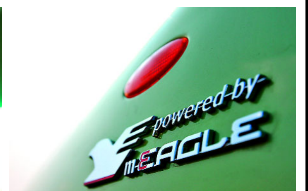
The Xylo's fenders proudly display what lies in store under hood - the fabulous mEagle turbocharged diesel engine.